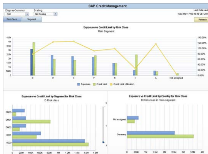
Figure 1: Dashboard for Credit Management Analysis

What's more, because it is imbedded into applications that support existing processes, this content helps to reinforce requirements such as regulatory compliance. In the end, you can minimize the risks associated with noncompliance and increase the business value of existing business processes.