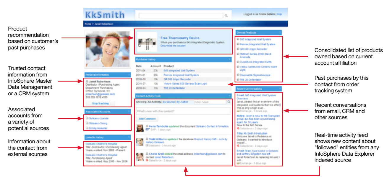
Figure 2: Example of an enhanced 360-degree view of a customer created using InfoSphere Data Explorer Application Builder